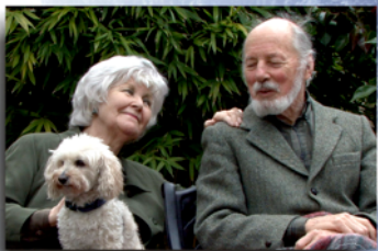
Caregivers share their journeys

This new educational film is an honest, poignant conversation with the spouses and children of people with dementia. Their emotional journey is full of bumps and unpredictable turns, as well as surprising beauty, even humour. Their insights are an education for anyone who is involved with someone with dementia, whether as a family member or a health care professional. Post-screening Q & A includes guests from the Alzheimer Society of BC, and researchers (UVic & VIHA) whose work is leading to more effective support for family caregivers.